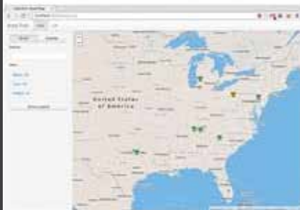
ASSET TRACKING - MAP VIEW