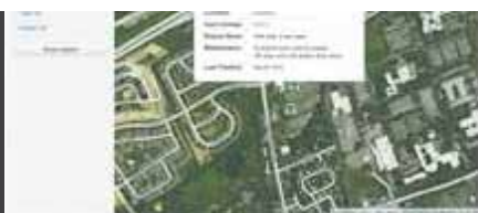
ASSET TRACKING - STREET VIEW